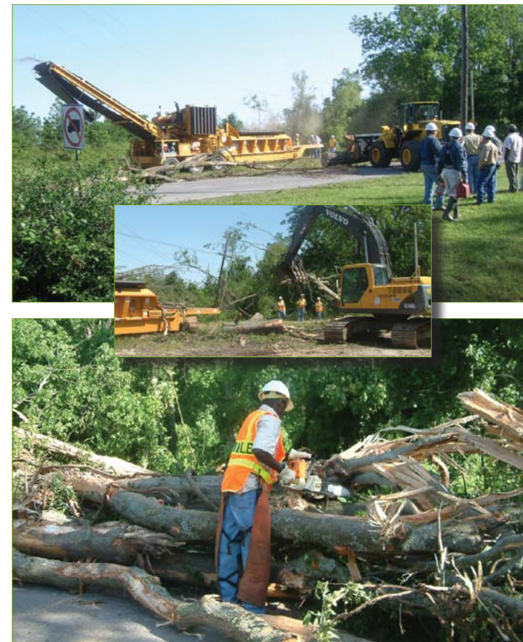
Top Photo: “The Beast” — a specialized wood chipping machine — converts trees into mulch. Middle and Above: Crews work to remove fallen trees and limbs in the northern portion of Coahoma County after a tornado hit in May.