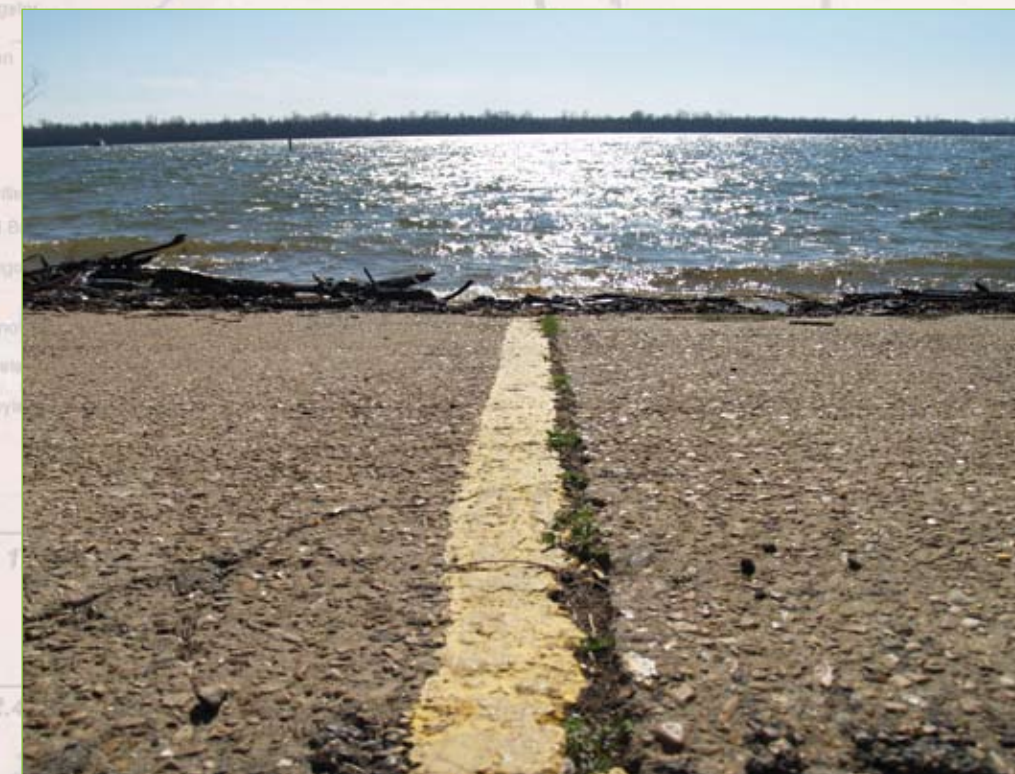
Above: The Mississippi River passed the 10-year flood marker at the Tunica RiverPark in April.