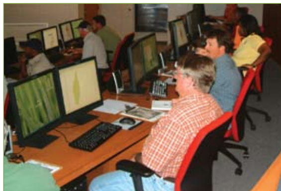
Above: YMDLB staff received introductory training in the use of Geographic Information System (GIS) data collection and software at Delta State University Center for Interdisciplinary Geospatial Information Technology.

The Yazoo-Mississippi Delta Levee Board has experienced rapid growth during the past 10 years in its mission to provide services to the communities in its 10-county district. Expanded services include land management, asset management survey, public education, policy management, and emergency preparedness.