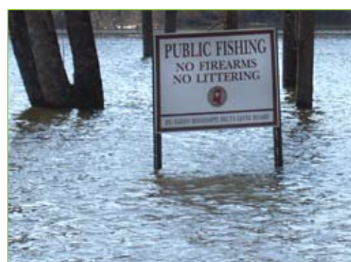
Top Left: Rock Quarry. Top Right: Tunica RiverPark Museum. Above: Seabrook Blue Hole.